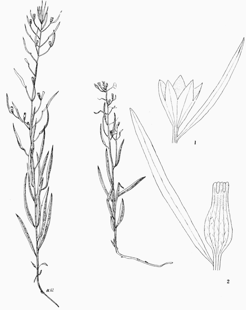
Fig. 3. Habit of Thesium ebraxteatum (Del. B. Křísa) and flower (1) and fruit (2).

plici racemosaque, coma bractearum sterilium, statura, rhizomate repenti stolonifero, forma magnitudinequo foliorum.