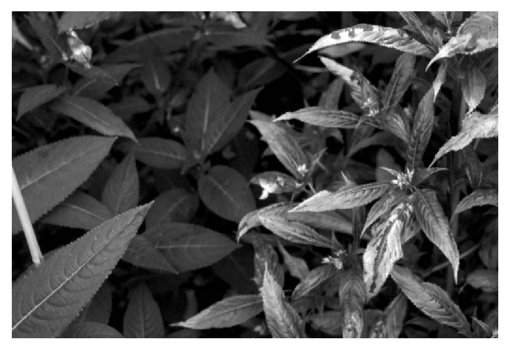
Fig. 1. – Flowering Impatiens glandulifera plants lacking (left) and showing symptoms of virus infection (right) in early August 2003.