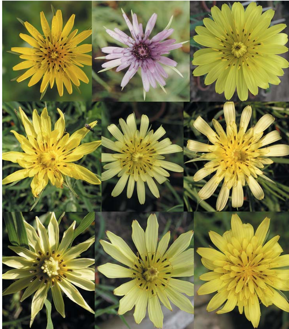
Fig. 1. – Capitula of Tragopogon taxa studied: T. pratensis (upper row, left; Planá u Mariánských Lázní), T. porrifolius subsp. porrifolius (upper row, middle; garden culture), and individuals from hybrid population of T. ×mirabilis in Roudnice nad Labem.

the top of stonewalls. One of the typical habitats is at the base of walls, fences etc. The most distant occurrence was along the road from Roudnice to the highway, i. e. some distance from the ruderal places in the town. The detailed distribution is given on Fig. 4.