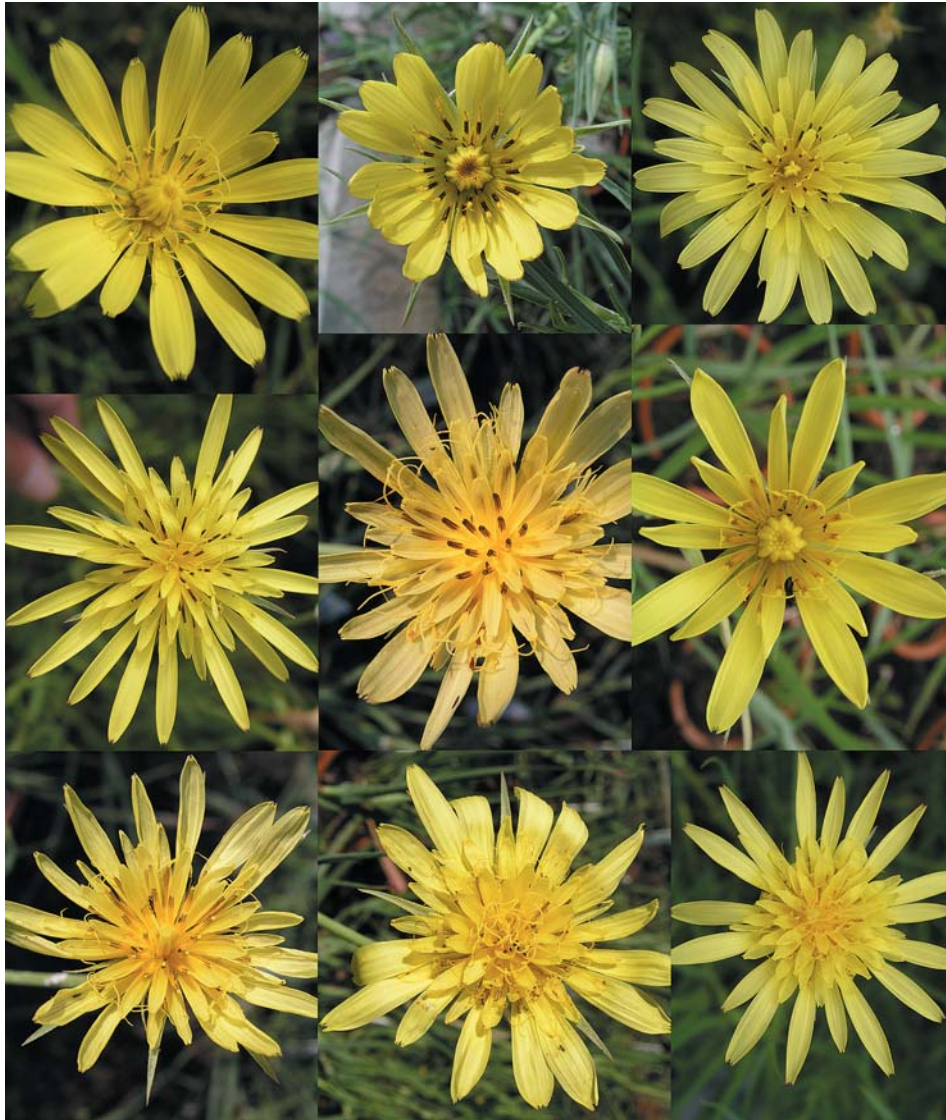
Fig. 2. – Capitula of Tragopogon xmirabilis from Roudnice nad Labem.