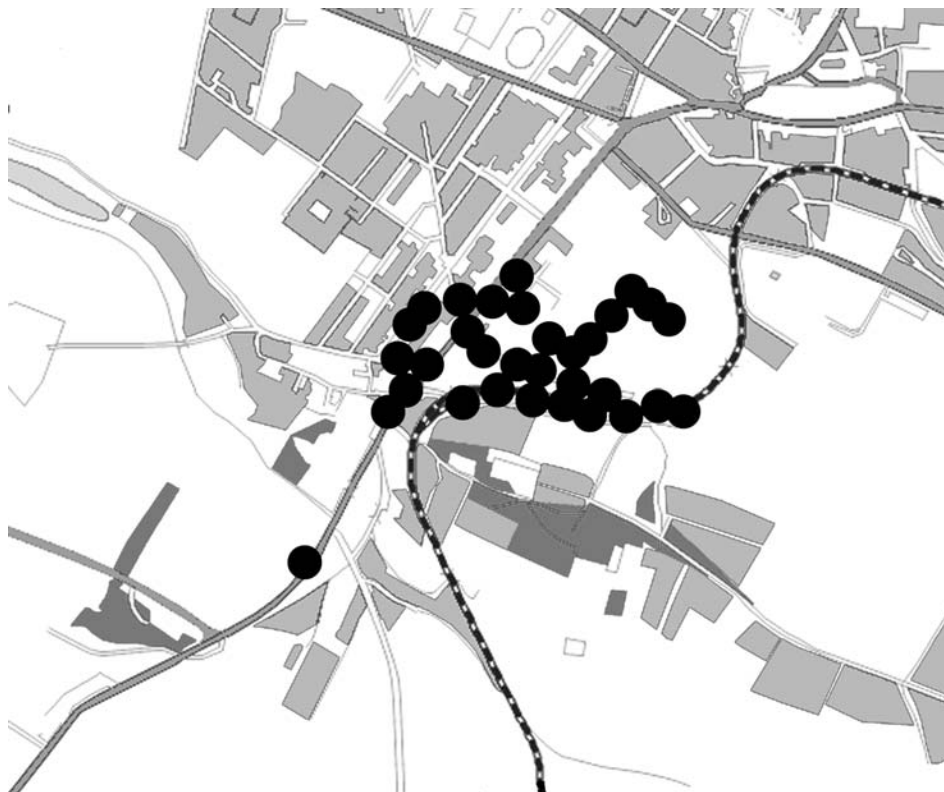
Fig. 4. – Distribution of Tragopogon xmirabilis in SW part of the town of Roudnice nad Labem.

involucral bracts and coloration of anther tubes. Polycarpic perenniality is a new character for Tragopogon in Central Europe. More than 800 plants grown from seed collected at this locality were perennials, forming new shoots on the root heads. None of the hundreds of T. pratensis plants in populations in western Bohemia, the area with richest population of this species in the Czech Republic, were perennial. We do not think it is a character, which appeared de novo in the hybrid plants. We think it is a reversal to the primary condition. This opinion is based on the fact that there are some perennial Tragopogon species such as T. ruber S. G. Gmelin, T. marginifolius Pawłowski, T. kotschy Boiss., T. montanus S. Nikitin and T. albinerve Freyn et Sint. The last three species were found to be the most primitive ones of Tragopogon in the phylogenetic analysis of the subtribe Scorzonerinae published by Mavrodiev et al. (2004: Fig. 5). The biennial life history (it is better to speak about monocarpic perennials, see also Qi et al. 1996) appeared independently at least two times within this subtribe, annuals at least three times. Based on the present knowledge one can only speculate about the advantages of the perennial life history for the plants in Roudnice. The richest population was at the train station, a habitat that is often occupied by annuals and biennials (as Oenothera sp., Berteroa incana , Daucus carota ).