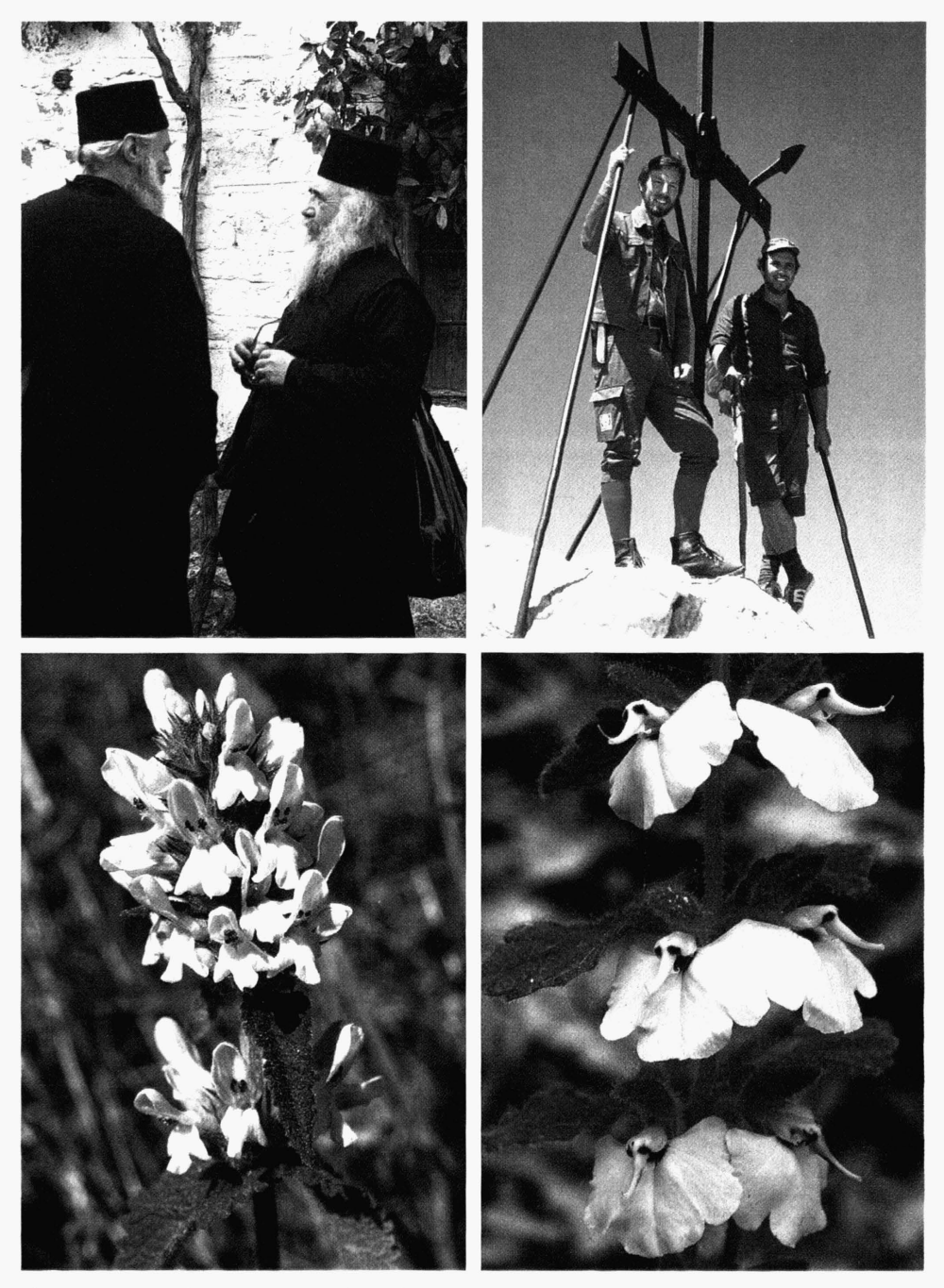
Fig. 4. – Upper row, left: Two of the local inhabitants of Mount Athos, right: At the summit of the Holy Mountain (2033 m), the present author on the left. Lower row, left: Stachys scardica Griseb., right: Rhynchocorys elephas (L.) Griseb.