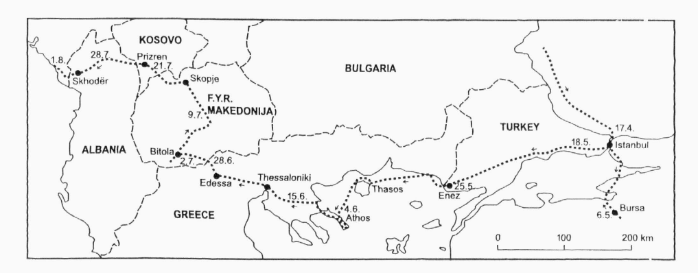
Fig. 2. – Grisebach's route through north-western Anatolia ("Bithynia") and the Balkan Peninsula ("Rumelia") in 1839. Some localities and dates are indicated.

Stay in Constantinopel and excursion to the Bithynian Olympus