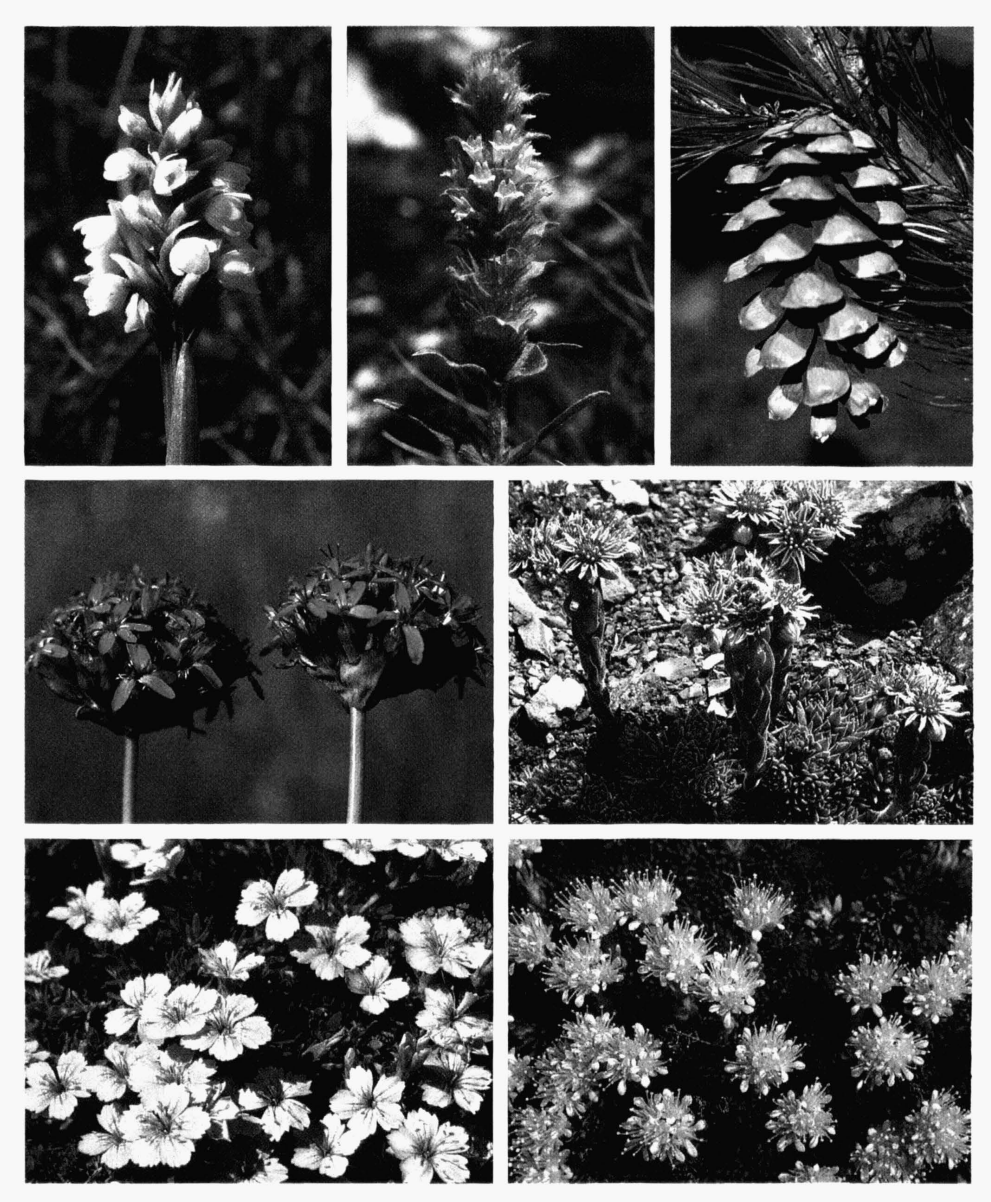
Fig. 3. – Some taxa described by Grisebach. Upper row, left Gymnadenia frivaldii Griseb., centre Sideritis scardica Griseb., right Pinus peuce Griseb. Middle row, left Silene asterias Griseb., right Sempervivum marmoreum Griseb. Lower row, left Dianthus myrtinervius Griseb., right Saxifraga juniperifolia Adams in Weber fil. et Mohr subsp. sancta (Griseb.) D. A. Webb.